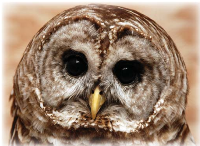
This young barred owl, whose eyesight is permanently impaired, is the newest member of The Raptor Center's education team.