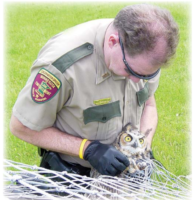
A conservation officer rescues a great horned owl from a soccer net for transport to The Raptor Center.